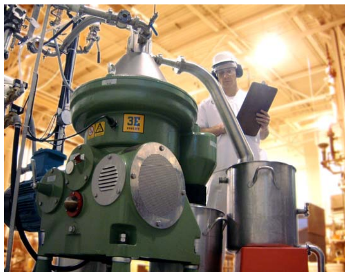
This explosion-proof deslugger centrifuge provides fast, efficient separation of degummed or refined oils and fats.